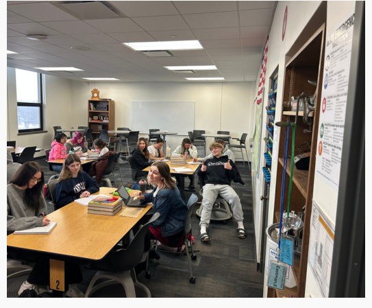
Two thumbs up for history!!